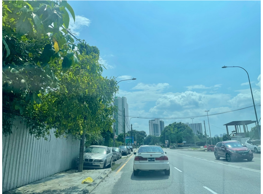
Jalan Puchong, Kuala Lumpur The land in on the Left of this photo, shown here with the zinc sheets hoardings