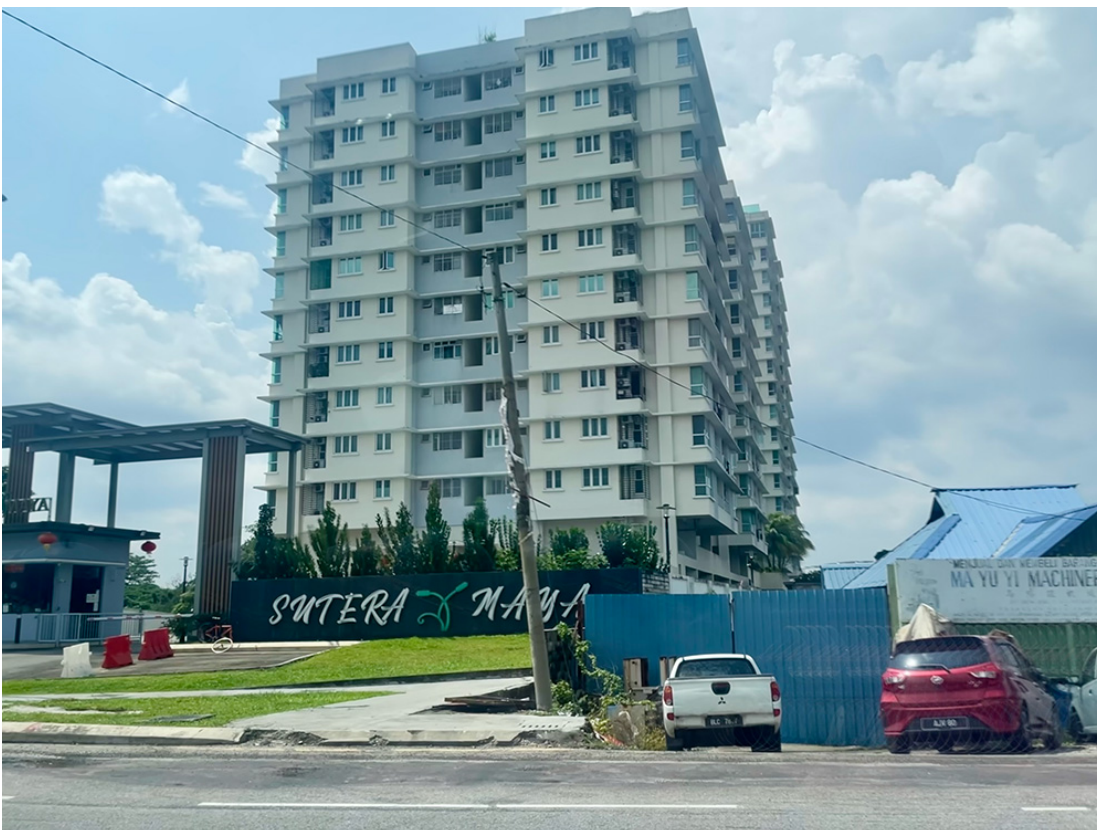
Sutera Maya Condominium, located opposite the subject land