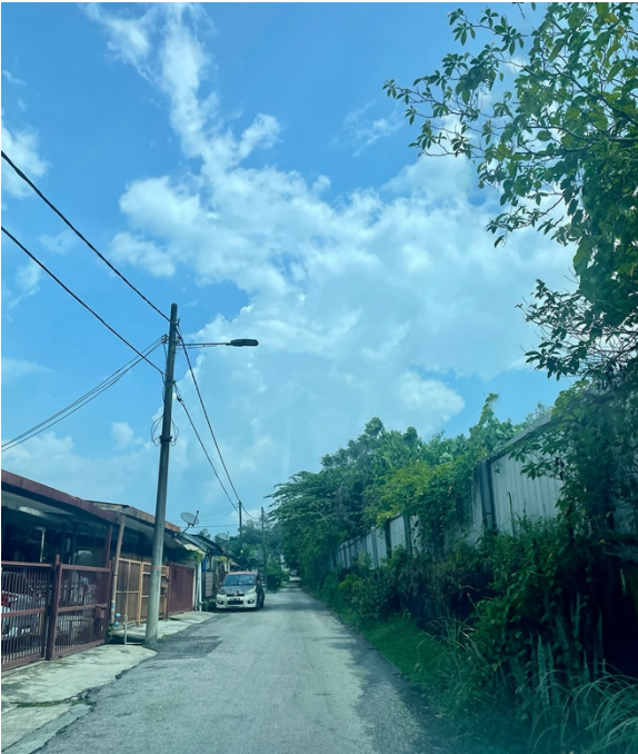
Jalan Puchong Batu 6 1/4. The land is on the Right of this picture